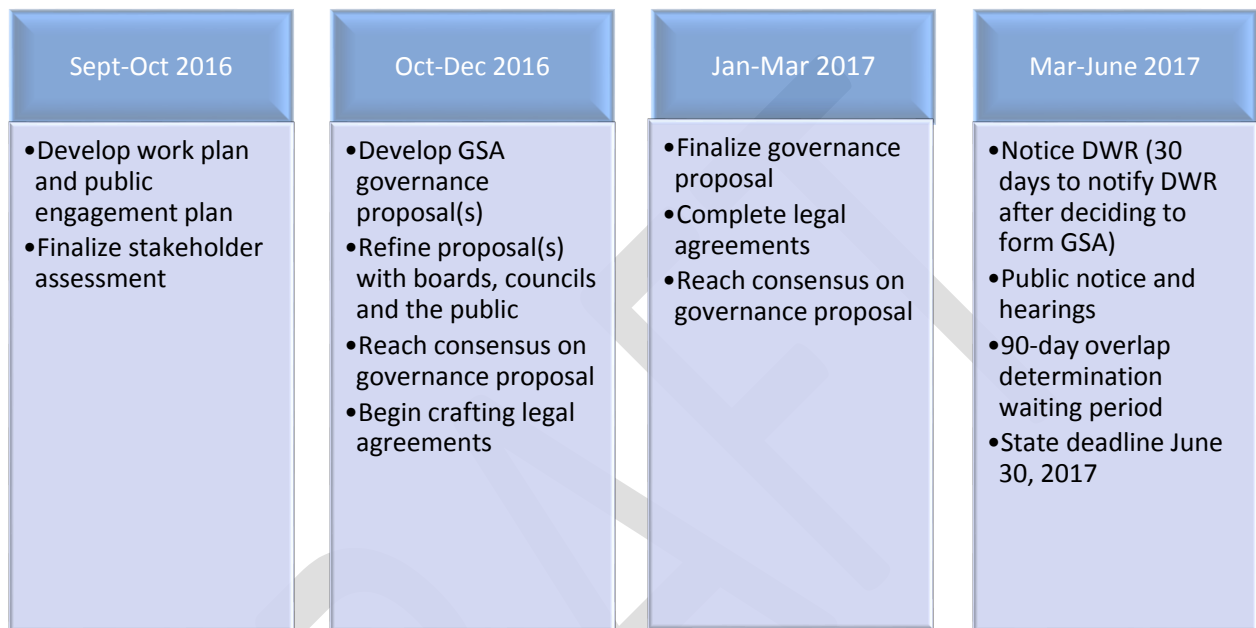
Figure 1. Process Outline/Timeline at a Glance

This Plan will implement outreach and engagement activities in accordance with the process outline established in the Assessment Report. See Figure 1 below.